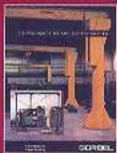
Jib & Conveyer Cranes