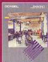
Seismic Zone IV