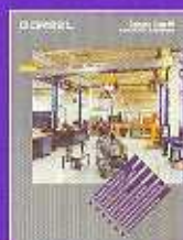
Seismic Zone IV