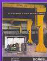
Jib & Gantry Cranes