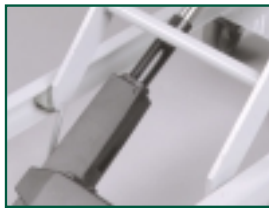
Electro-Mechanical Linear Actuator