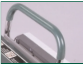
Comfort Grip Handle