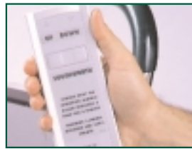
Lift/Lower Control Pendant