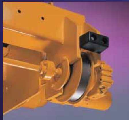
Totally enclosed, heavy-duty oil bath lubricated trolley traverse drive turns two rotating axle wheels connected by a line shaft. All wheels are supported on both sides by anti-friction bearings.

Combine the renowned Yale Cable King hoist with four double flanged steel wheels, a heavy duty, totally enclosed traverse drive and heavy duty steel frame and you get a top-running trolley of the highest quality, with the fastest hoisting speeds and widest capacity range in its class. With capacities ranging from 5 to 35 tons and lifts to 175 feet. Coupled with hoist motors to 30 Hp and a variety of control and other options, the Cable King Top-Running Trolley is the most versatile in the industry.