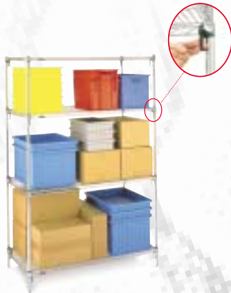
Super Adjustable Super Erecta™ — Easy-Adjust Storage System