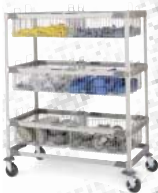
MetroMax® JIT Cart

For more information on Metro's handling systems and flexible production solutions, contact your Metro® Representative or call 1-800-433-2232 .