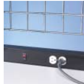
Convenient 8 outlet 110-volt power strip.