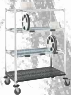
SMT Support Systems for Electronics Production