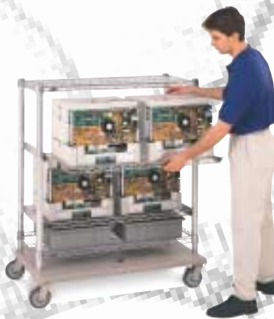
Starsys™ Work-in-Process Cart