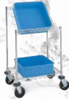
Benchside Tote Cart with Olympic™ Totes.