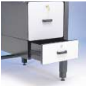
12" and 6" locking drawers accented with gray laminate face.