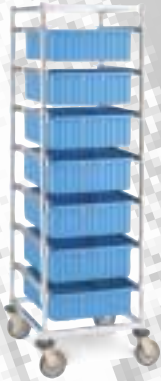
Adjustable Tote Box Carrier with Olympic™ Totes