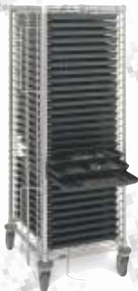
Tray Cart Material Handling Systems