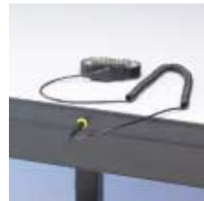
ESD tops include two built-in ESD banana jacks.