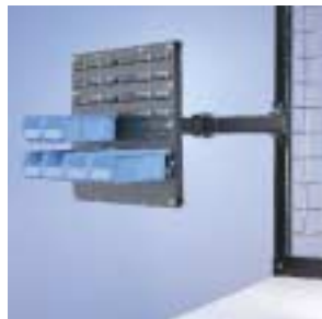
Space saving swing arm bin holder positions parts within easy reach.