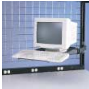
Ergonomic swing arm designed to hold computer monitor and keyboard.