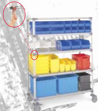
MetroMax Q™ Production Support Cart

For more information on Metro's handling systems and flexible production solutions, contact your Metro® Representative or call 1-800-433-2232 .