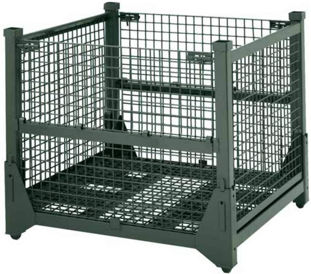
Available with corrugated steel or wire mesh sides.

Since 1970, Steel King industrial containers have set the standard for design and durability. Many standard and custom styles available, all with unique advantages that make all Steel King containers more convenient to use and longer lasting.