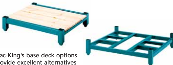
Stac-King's base deck options provide excellent alternatives for various industry applications.