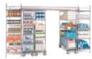
Super Erecta® Top-Track™