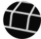
Decking for diverse applications (limited capacities).

Choose from a number of mesh patterns: 2" x 2", 2" x 4", 4" x 2", 1" x 4", 4" x 4" and 2-1/2" x 4".