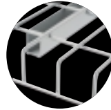
Decking with a waterfall for step beam applications.

American Wire Products' Wire Mesh Rack Decking is available in a variety of construction styles.